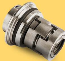
CR & CRN PUMP