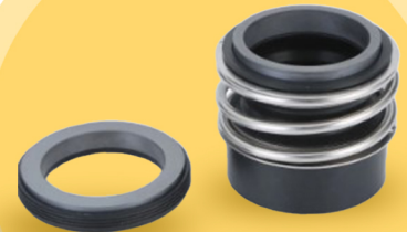
NB, NK & TP Pump

We maintain an extensive stock of mechanical seals compatible with all standard pumps